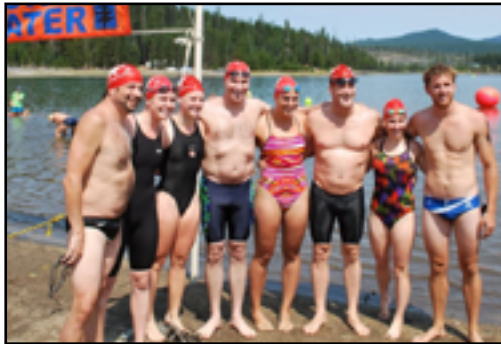
Small Team — Multmomah Athletic Club