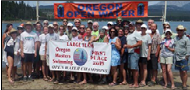
Large Team — Central Oregon Masters Aquatics

The OMS Association Open Water Championship is a single 1500-meter or 1-mile swim, this year the 1500-meter swim was at Eel Lake. The site rotates from venue to venue.