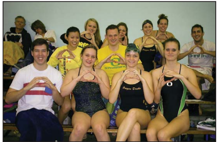
University of Oregon DUCK team at the Chehalem Meet

Saturday, January 25 th saw the annual Chehalem swim meet in Newberg host another popular event for our swimmers. This is always a popular winter meet regularly attracting from 80 to 100+ swimmers. A lot of the local teams showed up in force so there was a bit of inter-team rivalries going on. With a full menu of events to choose from, many swimmers had a full day and a lot of good efforts were seen, which led to a few tired swimmers after the meet was over.