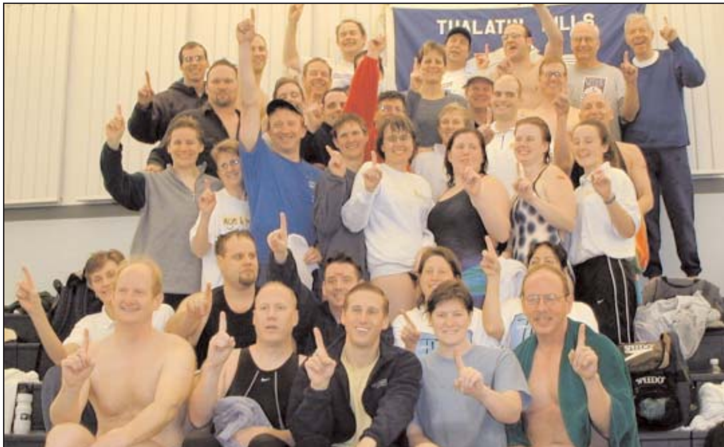
Tualatin Hills Barracudas celebrate their Large Team Championship