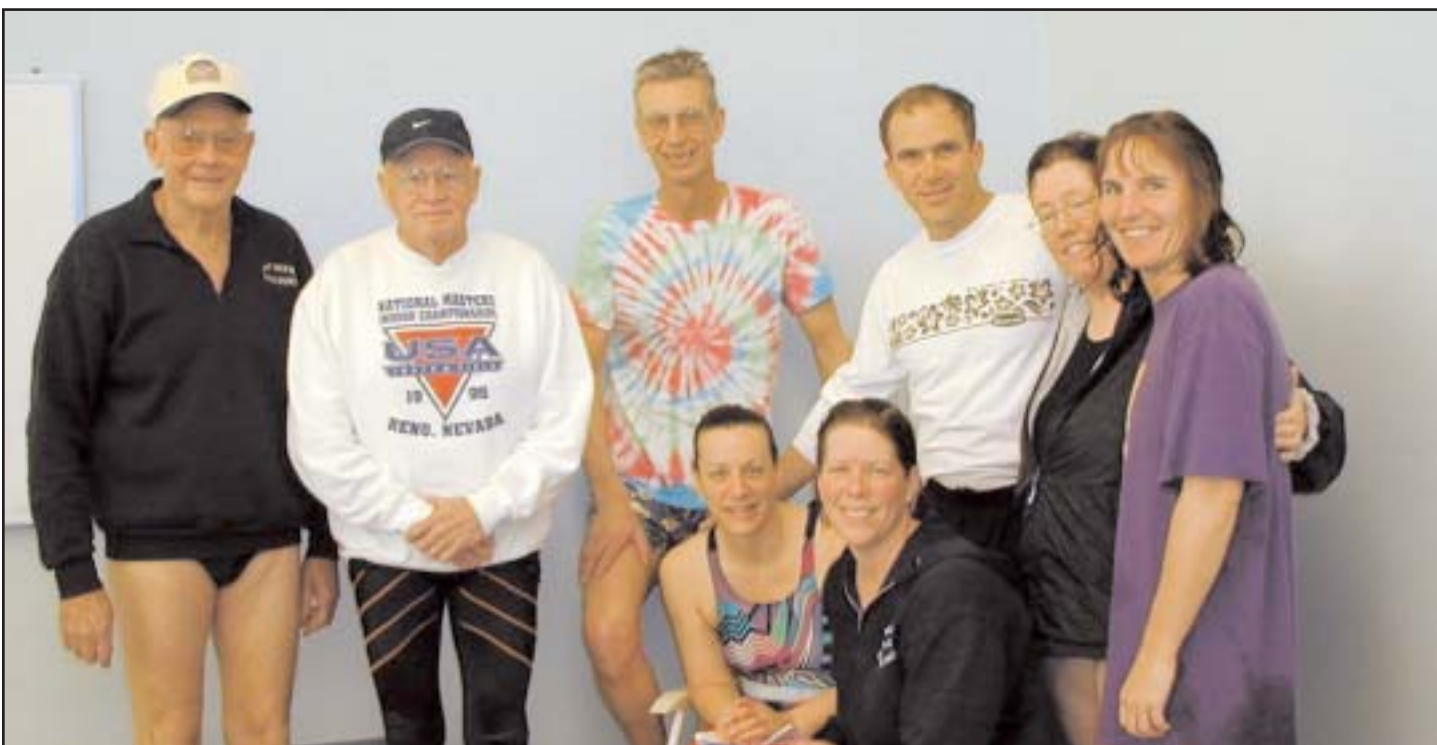
Mt. Hood Master - First Place Small Teams