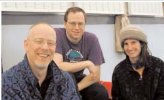
CAT - First Place Medium Teams